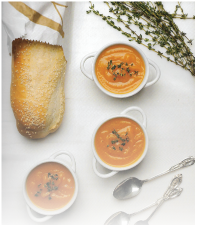
Recipe/Photo reproduced from The Silver Platter with permission of the copyright holder.